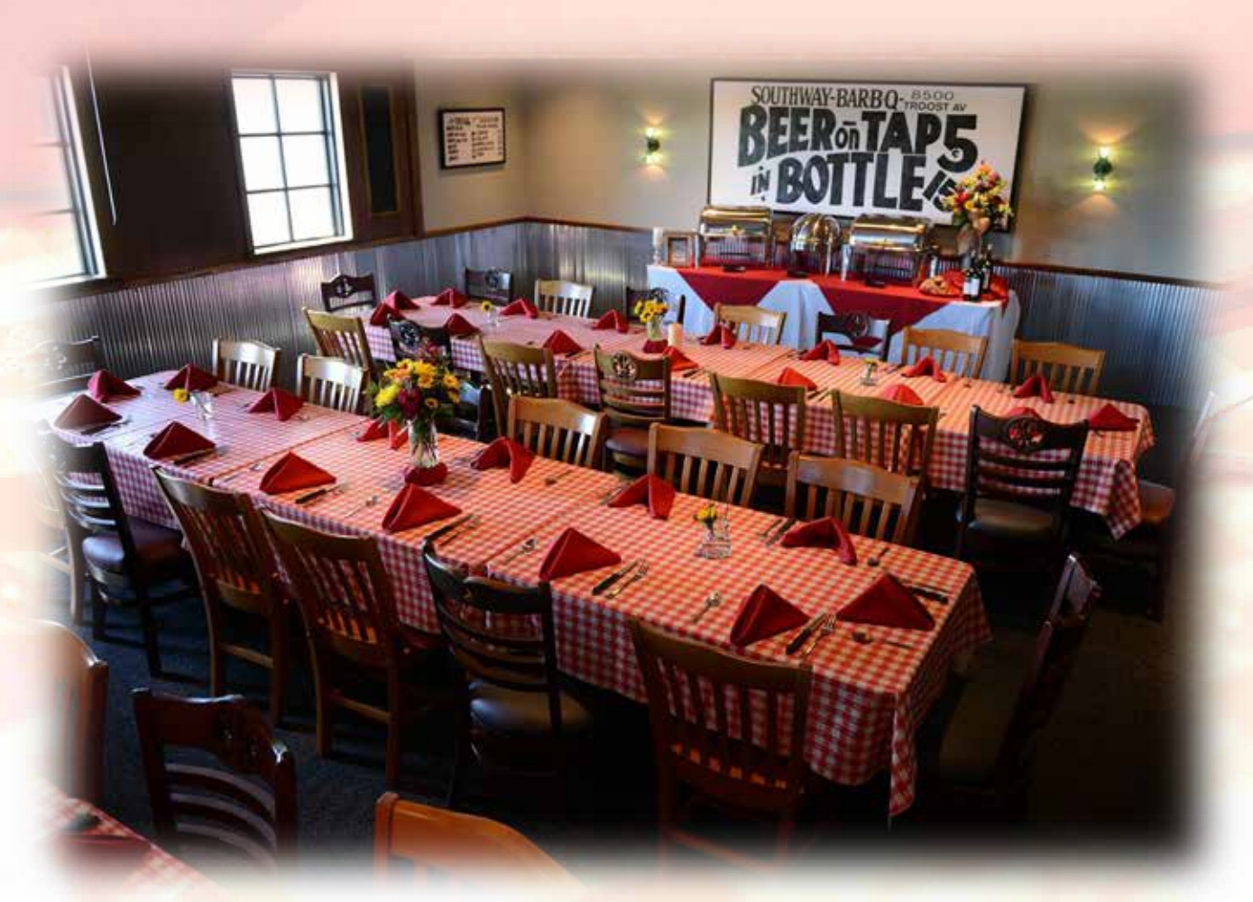
The Troost Room, seats 50

Order catering at: www.stroudscatering.com